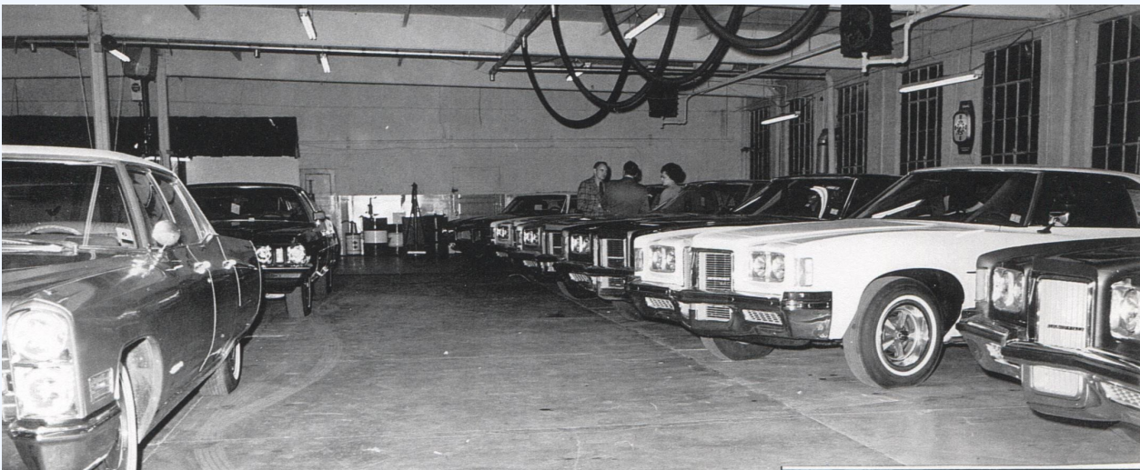
New 1972 Pontiacs on display with one new 1972 Cadillac and my 1967 Cadillac Fleetwood

In early 1972 I bought out a failing Pontiac Cadillac dealer in Peru, Indiana. This facility was very badly neglected. There was a mass mutiny of customers. I paid no blue sky and refused his entire remaining new car inventory and relic used cars. Folks, I did not marry well, so no deep family pockets and there was no bail out money. With my own unencumbered cash, I bought a business nobody wanted. I was 31 years old and the youngest known Cadillac Pontiac dealer in the country. Ne-